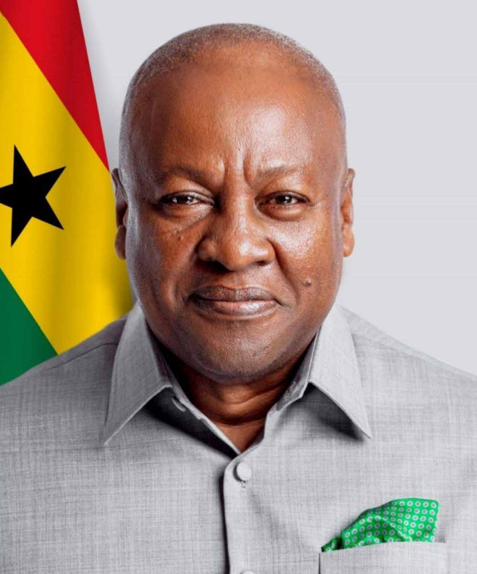
H.E. JOHN DRAMANI MAHAMA PRESIDENT OF THE REPUBLIC OF GHANA