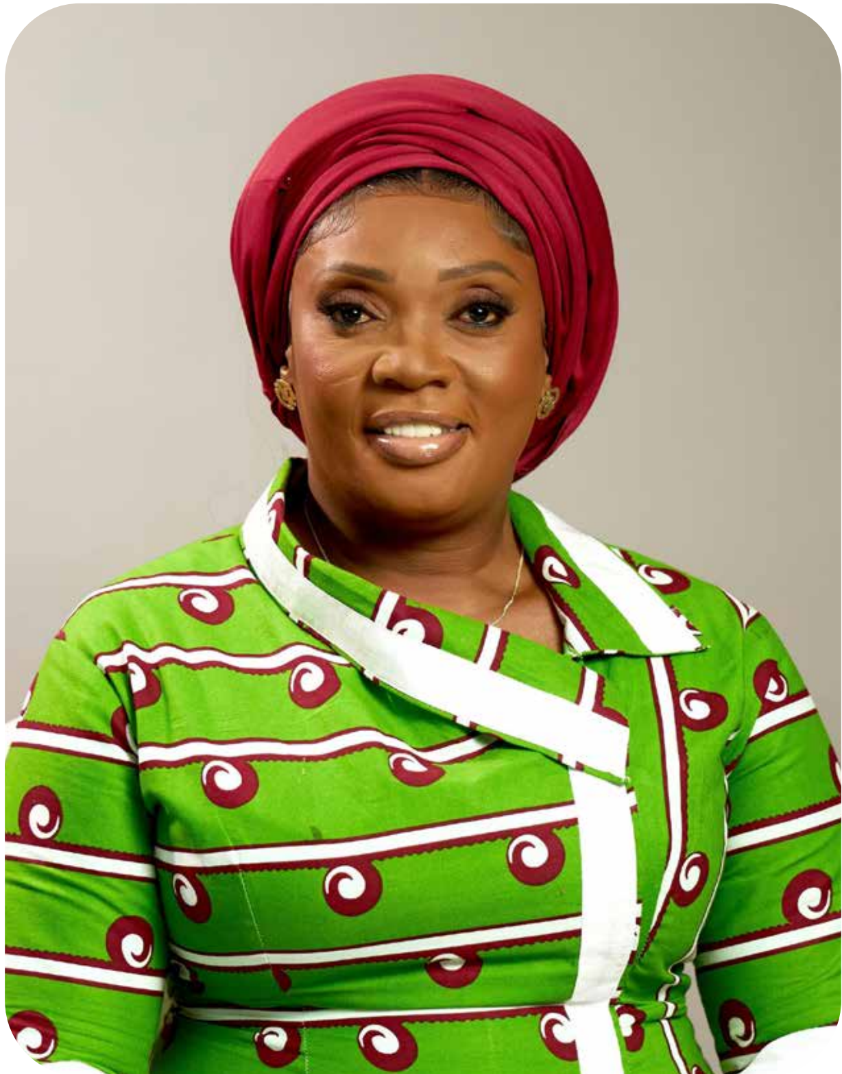
HON. RITA AKOSUA ADJEI AWATEY