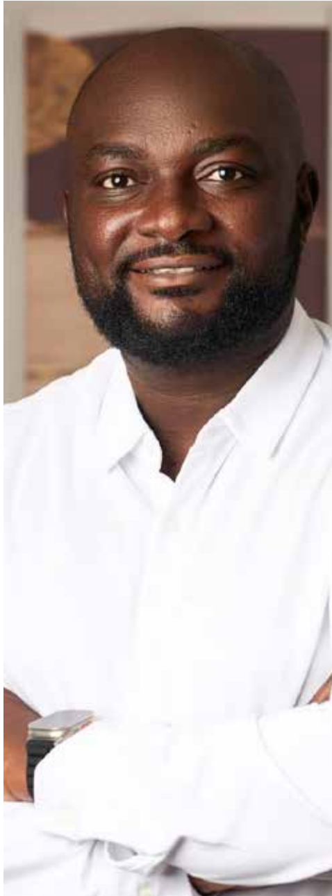
HON. DAVIES OPOKU ANSAH MP, Mpraeso Constituency