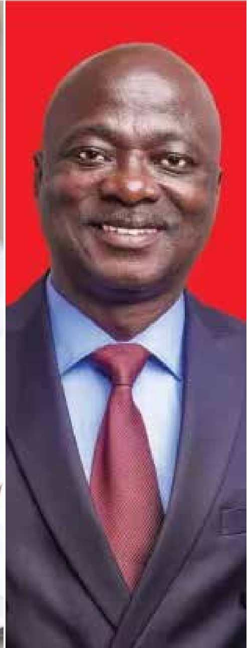
HON. JOSEPH FRIMPONG MP, Nkawkaw Constituency